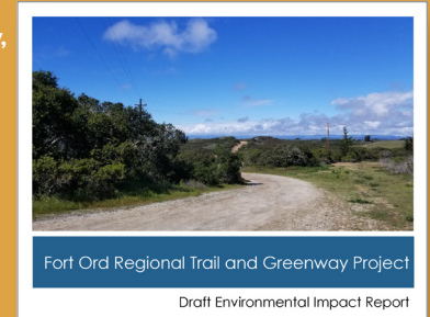
Fort Ord Regional Trail and Greenway Project

The cities of Del Rey Oaks, Seaside, Marina, and Monterey, along with the County of Monterey, and the Monterey Peninsula Regional Parks District certified the Final Environmental Impact Report and approved the FORTAG Master Agreement in 2020.